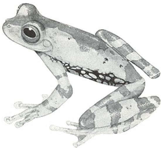
Upper figure, Hyla xanthosticta (KU 103772); lower figure, Hyla pseudopuma infucata (KU 101770). \times 2 .