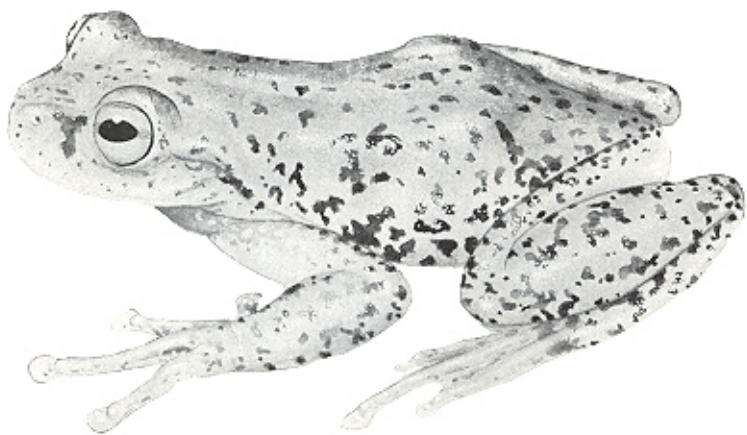
Upper figure, Hyla pellita (KU 100973); middle figure, Hyla pellita (KU 100970); lower figure, Hyla siopela (KU 100977). \times 2 .