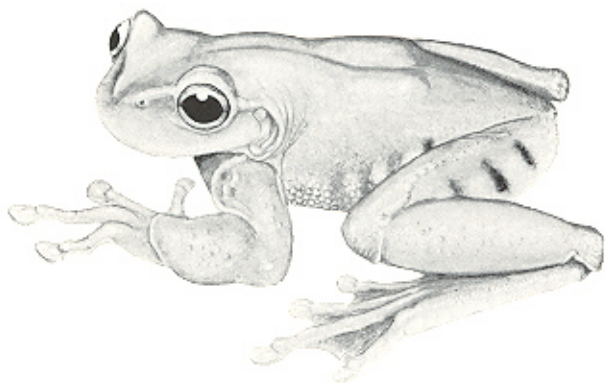
Upper figure, Hyla altipotens (KU 101001); lower figure, Plectrohyla hartwegi (UMMZ 94428). \times 1 .